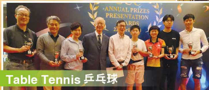
Table Tennis 乒乓球