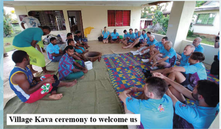
Village Kava ceremony to welcome us

我們於五月二十五日(星期四)出發前，會長給我們木球隊、在斐濟的新朋友和東道主的說話。