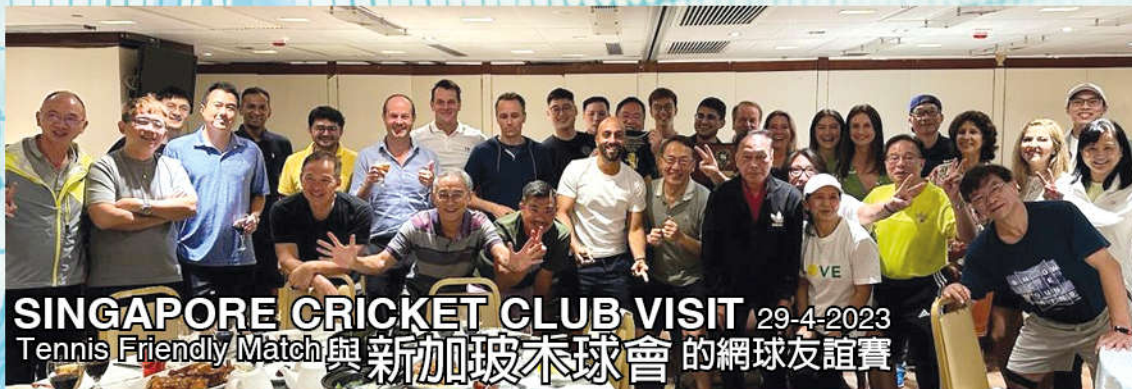
SINGAPORE CRICKET CLUB VISIT 29-4-2023 Tennis Friendly Match 與新加坡木球會的網球友誼賽