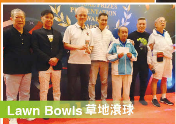
Lawn Bowls 草地滾球