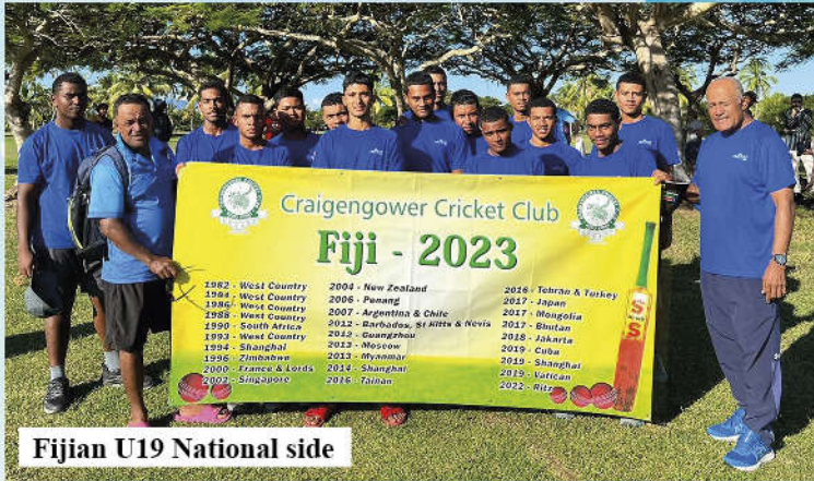
Fijian U19 National side

Finally, I send my sincere best wishes to all our new friends in Fiji and acknowledge their efforts to promote the game. Thank you in advance for your hospitality, tolerance and kindness.”